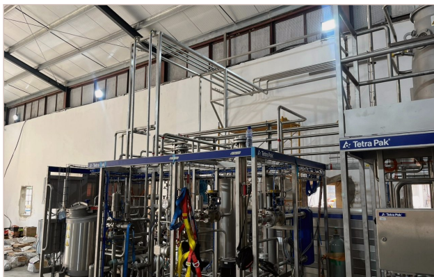
Industrial installation environment

The draft profile identifies Hurlag's head office and fabrication yard/warehouse capacity around Lagos and Ogun State, supporting material staging, fabrication, storage and project mobilization.