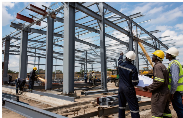
Structural fabrication and frame works