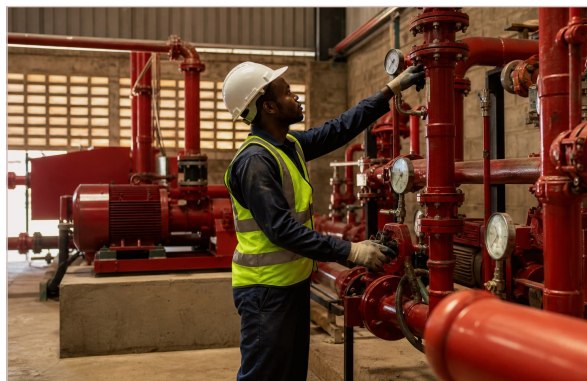
Fire protection systems and safety infrastructure