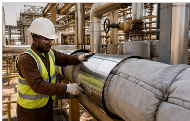
Thermal insulation and cladding