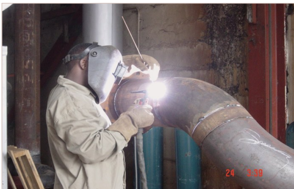
Pipe welding and repair execution