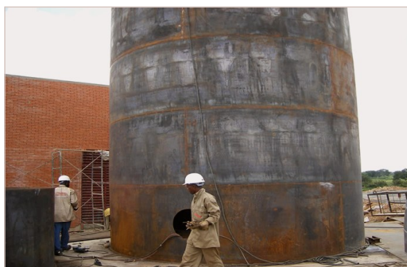
Raw-water and process tank fabrication