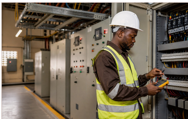
Electrical installation and control support