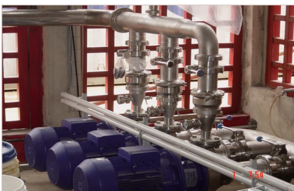
Pump-room and pipework installation

Raw-water conveyance, pipe networks, tanks, pump systems and maintenance-ready service infrastructure.